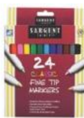
22-1524 24ct Classic Fine Tip Markers