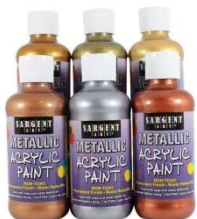
#25-2399 Metallic Acrylic Paint