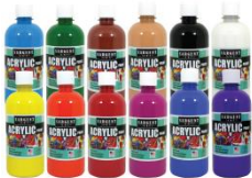
#24-2499 Acrylic Paint

Materials: plaster of paris, gauze, plastic face molds, small detail brush