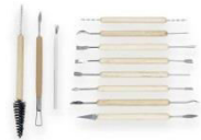
#23-9111 11 ct. Sculpting Tool Set