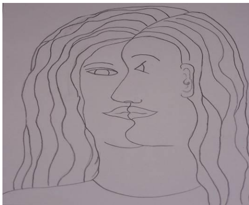
Profile in the middle of the face Both ways will begin with half of the face shown from the side or profile. Then complete the rest of the face from a front view

Instruction: Demonstrate to the class two different ways to draw the "split portrait".