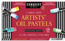
#22-2015 Lg. Oil Pastel

Pictures of Pablo Picasso's abstract portraits, white paper