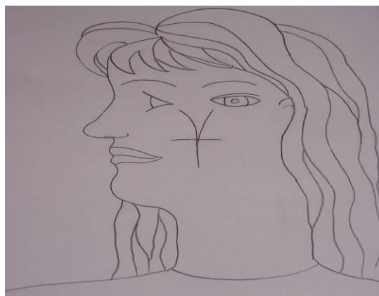
Profile at side of the face

Both ways will begin with half of the face shown from the side or profile. Then complete the rest of the face from a front view