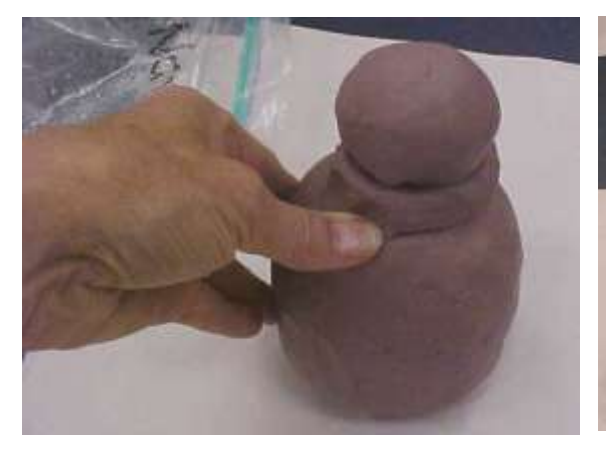
Form a ball and attach to make the head.

4) Roll out a ball of clay and attach for a head at the top of the uppermost pinch pot.