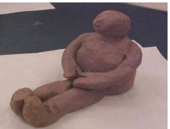
Roll coils for arms and thicker coils for legs and attach securely. Form hands and feet.