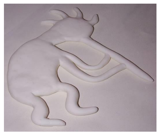
Finished Kokopelli ready to dry