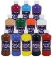
#24-2499 Sargent Art Acrylic Paint