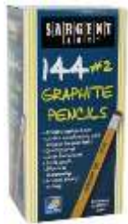
#22-7244 144 ct. Graphic Pencils

Time: This lesson may be modified from one to five hours, depending upon the size and complexity of expectations.