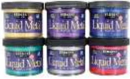
#22-1206 Liquid Metals Acrylic Paint