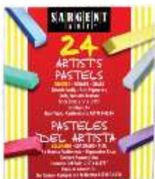
#22-4124 Sargent Square Chalk Pastels