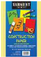
#23-40xx 50 sheets Black construction paper solid color pack