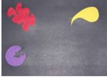
Construction paper shapes added

Instruction: Students will begin with one piece of 12" X 18" black construction paper. Use 3" X 4 1/2" pieces of various colors to create and cut at least three shapes. There can be more than three shapes and the shapes may be geometric, organic shapes, or both. Glue these shapes down onto the black paper.