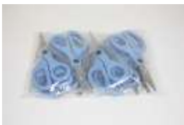
#22-0914 12 ct. Pointed Tip Student Scissors Best-Pack