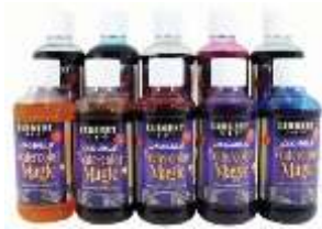
#22-6010 8oz. Washable Watercolor Magic 10 pcs.

Materials: Paper plate or plastic palette, student grade watercolor paper (or butcher paper or parchment paper), scrap paper for lettering practice, Viva or Bounty paper towels, masking tape, rubbing alcohol, Q-tips, salt, plastic wrap, small plastic containers w/ lids ( for watercolor, salt, alcohol), large plastic containers (for water), hole punch, yarn or DMC thread, 1/4" diameter or smaller dowels (2 pieces per child), hair dryer