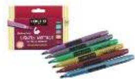
#22-1506 Metallic Medium Point Peggable Carton