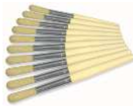
#56-1100 10ct. Jumbo Brush pk, plastic handle