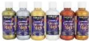
#22-6097 8oz. Washable Metallic Watercolor Magic 6 pcs.