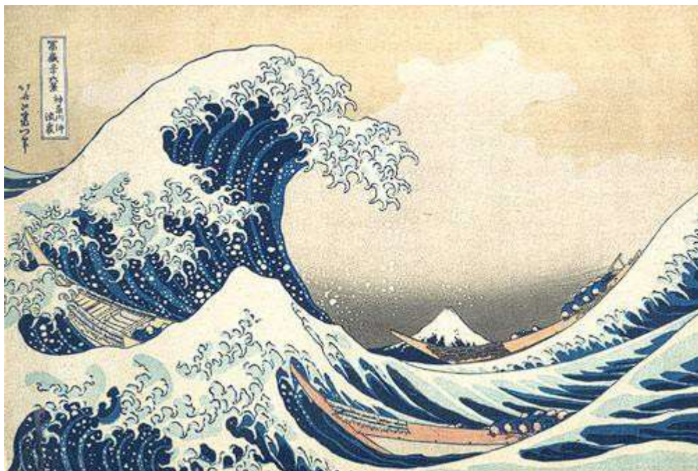
The Great Wave at Kanagawa- Hokusai (Japanese, 1760–1849)