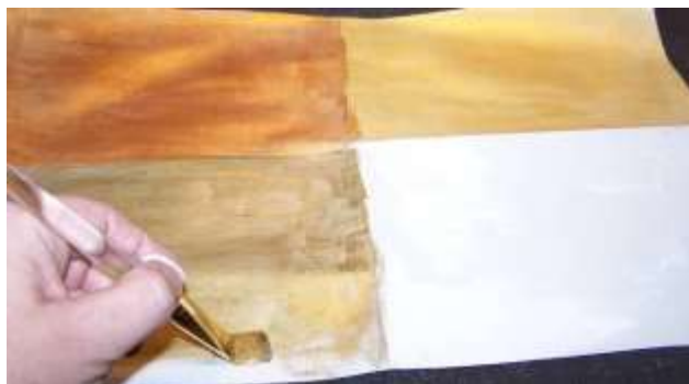
Creating gold paper

Use construction paper to add details onto the tree. Black markers could also be used instead of black construction paper. Gold foil paper may be used or students may create their own gold paper by painting white construction paper with Sargent Art Metallic tempera paint. You may want students to use Sargent Art metallic markers for small details or if students seem to have trouble painting in the spirals.