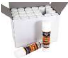
#22-1403 Glue Stick