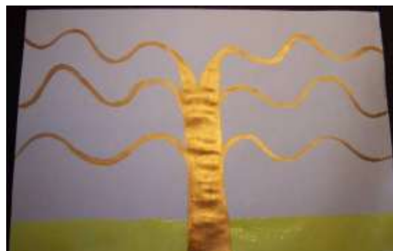
Painted with metallic tempera paint

Paint this tree with Sargent Art gold tempera paint. The branches are then added onto the limb sending them in a spiral. You may want students to paint them on directly without drawing since they may draw them too small to be successfully painted. Paint a ground line using Sargent Art yellow glitter tempera paint. Allow finished tree to dry.