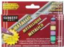
#22-1506 6ct. Metallic Medium Point Peggable Carton markers