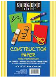
#23-40xx 50 ct. Construction Paper solid color pack black and white

White paper, pictures of Gustav Klimt's work (use Google images Internet search), containers for water, paper towels, gold foil paper or paper painted with Sargent Art Metallic Tempera paints