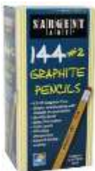
#22-7244 144 ct. Graphic Pencils