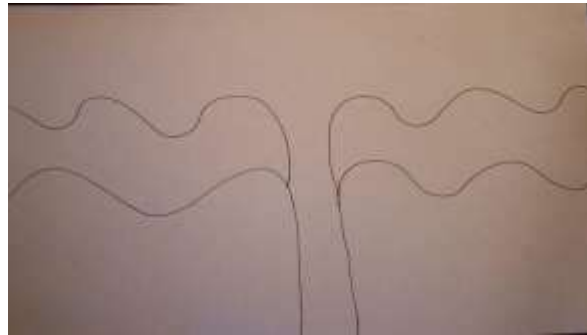
Add limbs off the edge of paper

Continue the line going out from each side of the rectangle in a curved up and down line off the edge of the paper. Raise the line in the middle up a little before drawing another curved limb off both sides of the paper. Be sure to leave enough room to add the spiral branches later. Continue to add limbs on both sides of the paper until there are three limbs on each side of the trunk of the tree. Close off the top of the limbs into a V-shape.