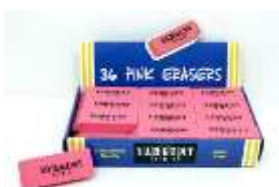
#36-1012 36 ct. Pink Eraser Best Buy Pack