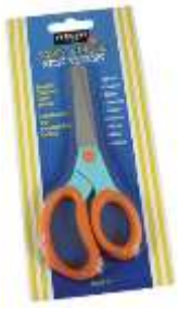
#22-0907 Children's Cushion Grip Scissors