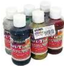
#22-6818 6pk. 4oz. washable Art-Time Tempera Set (Glitter)