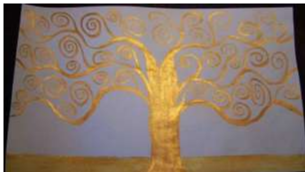
Finished painting ready for details