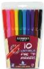
#22-1570 10ct. washable Fine Bullet Point Peggable Pouch markers