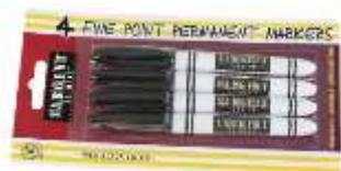
#22-1565 4ct. Black fine Bullet tip Permanent Markers

Time: 3 or more art periods depending on complexity desired.