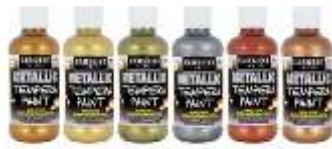
#17-5099 16pc. 8 oz. Metallic Tempera Paint