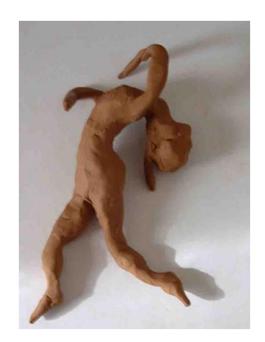
5. Clean up with soap and water.